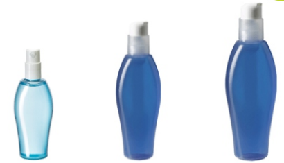
50 ml M 19 100 ml M 24 200 ml M 24