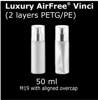
Luxury AirFree® Vinci (2 layers PETG/PE) 50 ml M19 with aligned overcap