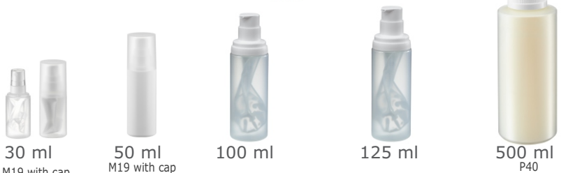
30 ml M19 with cap or aligned overcap 50 ml M19 with cap or aligned overcap 100 ml M32 with aligned overcap 125 ml M32 with aligned overcap 500 ml P40