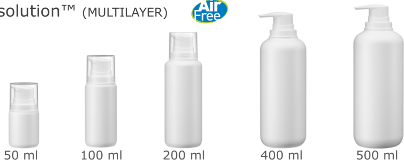
50 ml 100 ml 200 ml 400 ml 500 ml